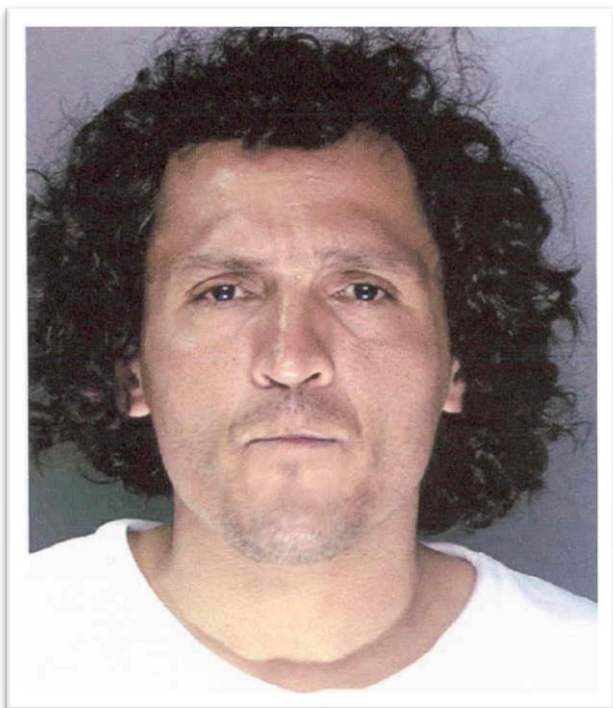
Old mug shot prior to arrest

He was apprehended shortly thereafter in Iowa.